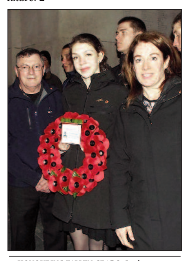
HONOURING FALLEN GRADS: Students performed and laid wreaths at the Menin Gate.

The Lisgar music trip to France and Belgium will forever be etched into our memory—not only did we have fun, but we felt as though we had truly honoured the Lisgar spirit abroad, tying together important moments of our school's past with our hope for the future.