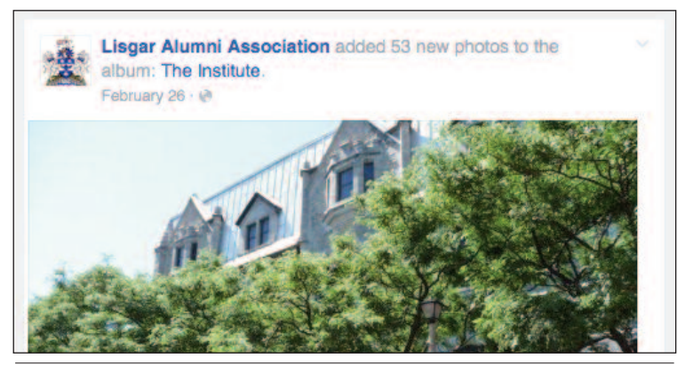
GOING SOCIAL: Like us on Facebook at facebook.com/LisgarAlumniAssociation for all the latest news.

out one issue each year going forward, however, rather than two, given the increasing costs of printing and mailing, and the growing popularity of social media across all age groups.