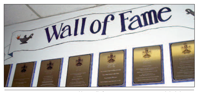
DISTINGUISHED\ IN\ SPORT:\ Lisgar's\ Athletic\ Wall\ of\ Fame\ recognizes\ twenty\ accomplished\ alumni.

The twenty remarkable men and women who have been included in our first two inductions have made their mark in a wide range of endeavours, and in time periods spanning almost a century. While their full range of achievements cannot be listed here,